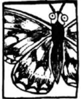
Marbled white butterfly