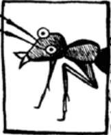
An ant named Bertha